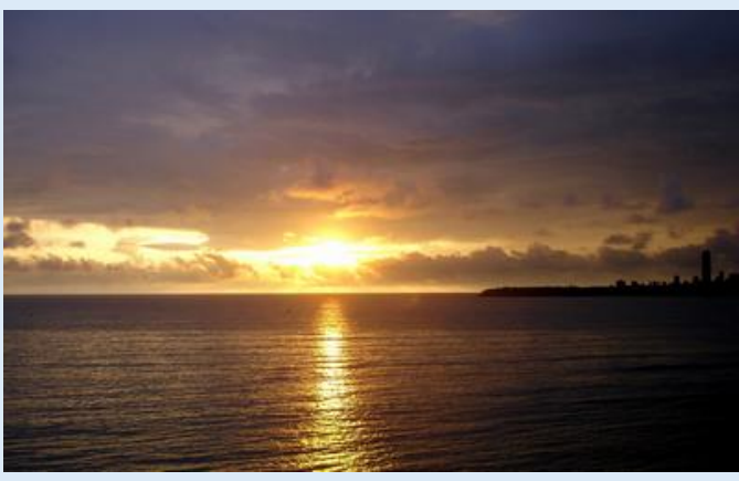
Sunset in Mumbai