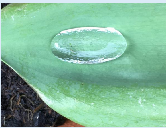
What is it? It's a Raindrop on a leaf Marula