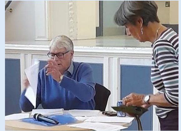
Now Who Has Won