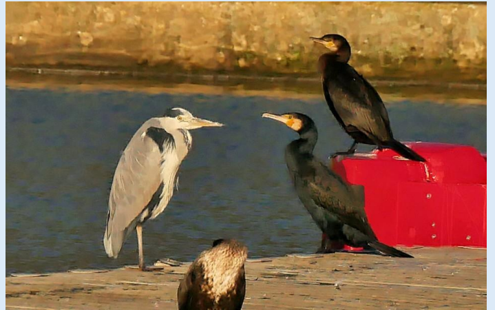
Cormorants having a friendly chat at Fairlands - Sarojin Ellis