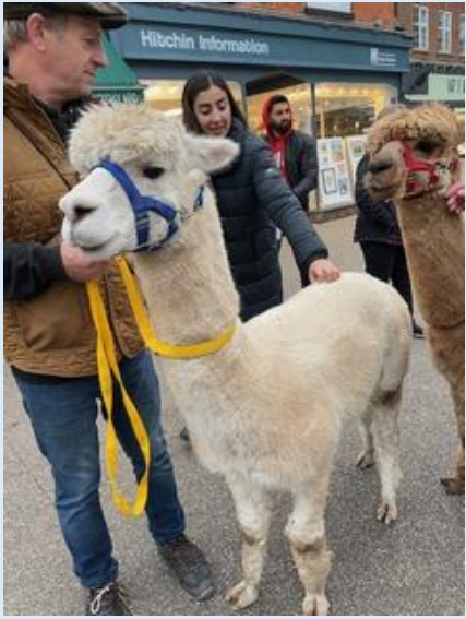
Alpacas in Hitchin