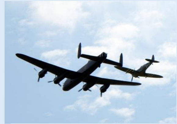
Lancaster and Spitfire over Pirton