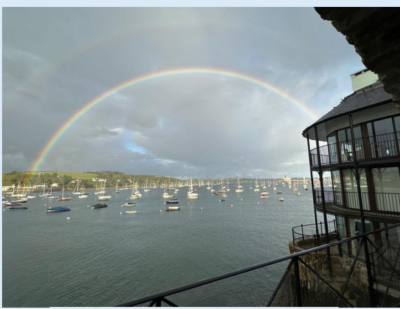
Falmouth - Marula