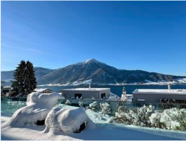
Mount Zug, Switzerland. Reeta Bhatiani.