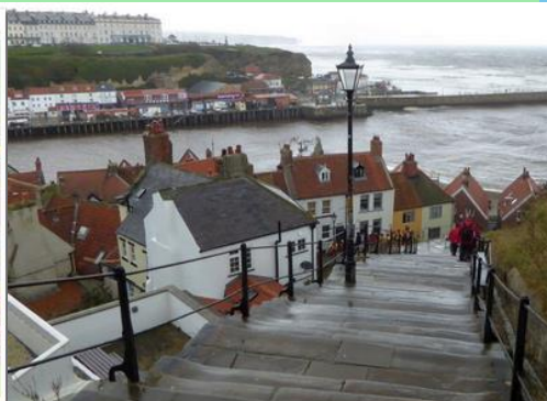
Wet and Wind Whitby