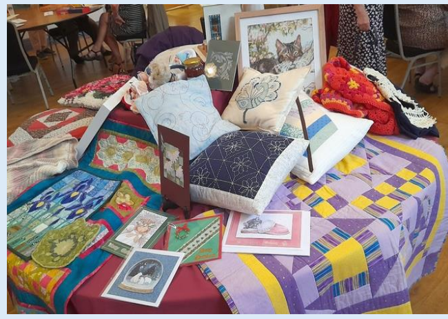
Group Fest Craft Group's Work